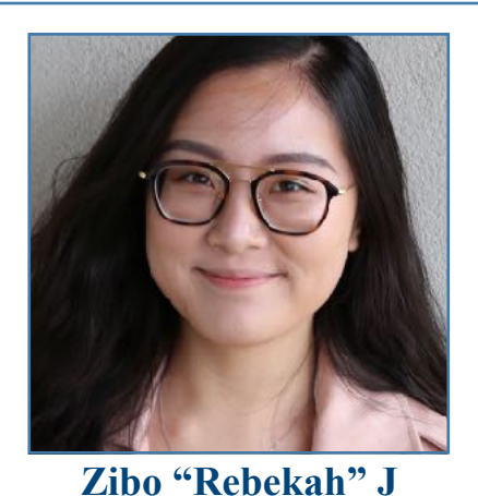
UNIVERSITY OF WISCONSIN

Three words... Challenging, inspiring, engaging